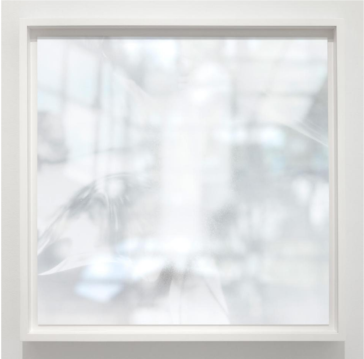
Tad Beck 'Lovell 08.28.18' (2018) from the series 'Blanks' archival inkjet print, 24 x 24 inches IMAGE COURTESY OF THE ARTIST AND GRANT WALQUIST GALLERY

photographic paper, manipulating shadow and window light from his studio reflected on the print, surveying the evolution of photographic processes and how we view photographs. Inspired by Cy Twombly and sound artist Alvin Lucier, Beck is preoccupied with the mediums he chooses. Blanks is reminiscent of, if not a homage to, Robert Rauschenberg's 1951 series of stretched white canvases that coyly hint at minimal brush or roller marks.