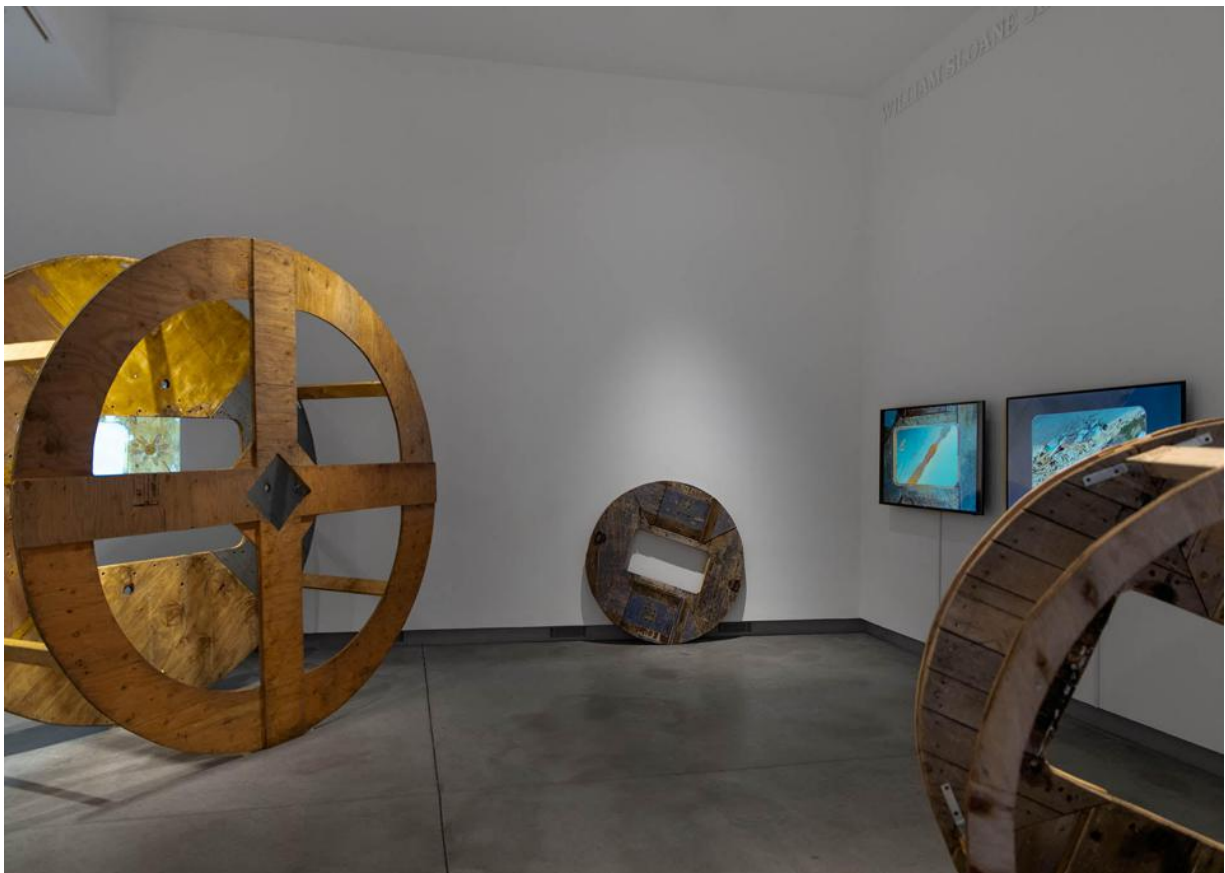
Tory Fair 'Tory Fair: Portable Window' installation view (2021)