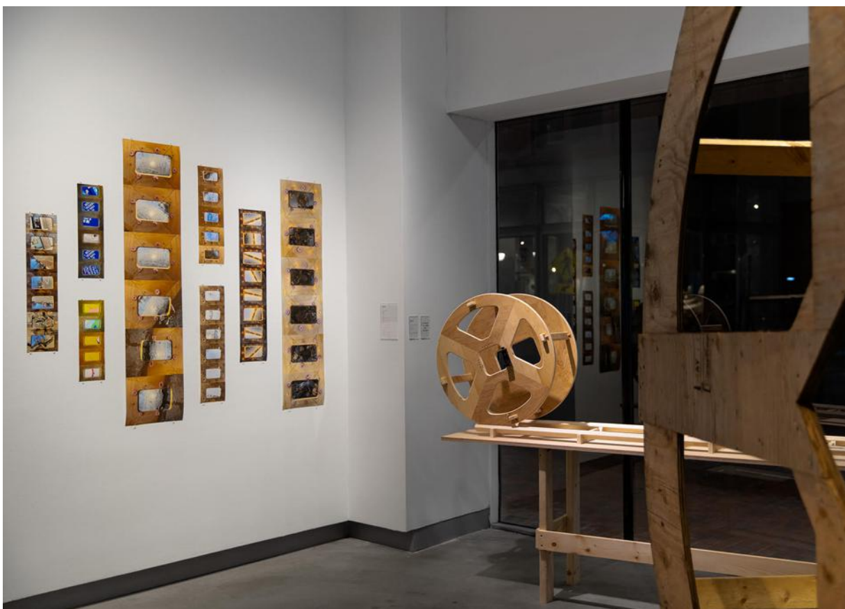
Tory Fair 'Tory Fair: Portable Window' installation view with video stills and Table top Portable ... [+]